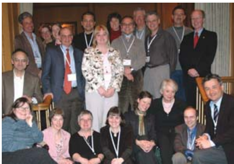
National Guidelines Workshop Participants: